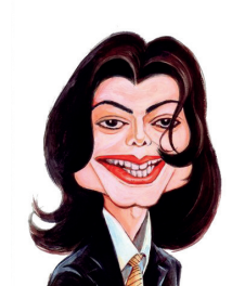
KING OF POP

Green sencha with lime You like to go with the flow of life, you're responsible, opportunistic and charming.